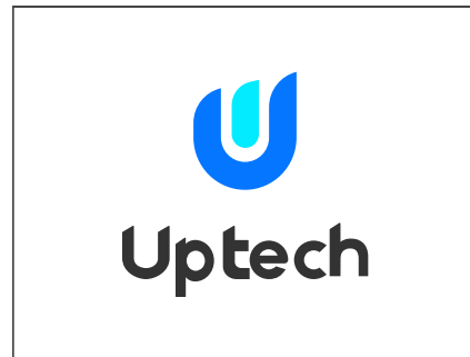
01.Full-color Version Logo color: full-color Background color: white

The primary brand visual identity of Uptech is the standard logo. However, when the width of display area is fixed or limited, the vertical logo can be used as the second option. The relative size and position of its elements are fixed, and the text logo cannot be used alone. All Uptech logos cannot be redrawn or combined without authorization. The usage scenarios of vertical Uptech logo include: using full-color logo on white / light background; using reverse logo on dark background, when necessary; using K100% logo when standard logo cannot be used in single application scenarios in a comfortable way, such as single color form, fabric embroidery, screen printing, fax paper, memo, etc.