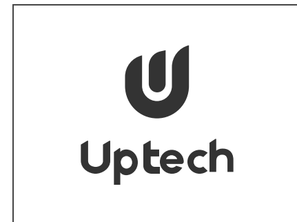
04. Black Version Logo color: Uptech black Background color: white