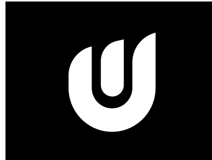
03. Inverted-color Version Logo color: white Background color: Uptech black