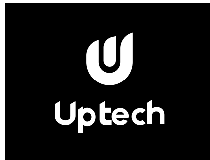
03. Inverted-color Version Logo color: white Background color: Uptech black